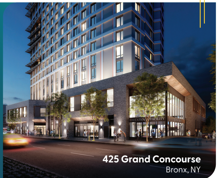
425 Grand Concourse Bronx, NY